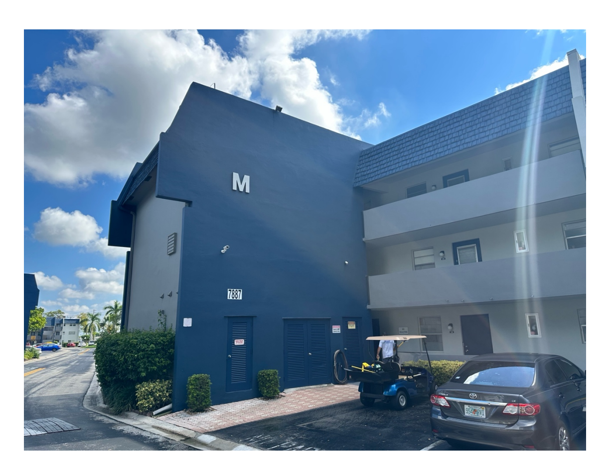
Oriole Golf & Tennis Club Condominium One Bldg. M (7887)

7887 Golf Circle Drive, Margate, FL 33063